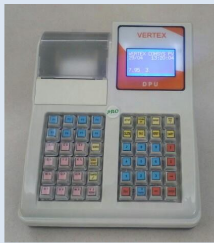
VERTEX DPU 48 KEY