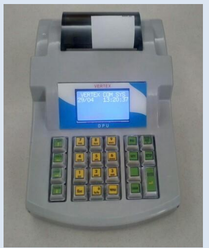
VERTEX DPU 24 KEY