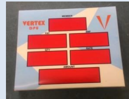
Remote Display Big