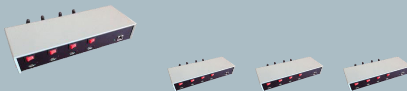
IP GSM Modems 4-16 ports